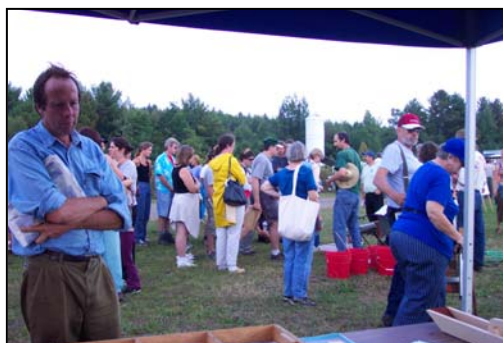
Above: Fairgoers watching the wet vegetable seed separator demonstrations.